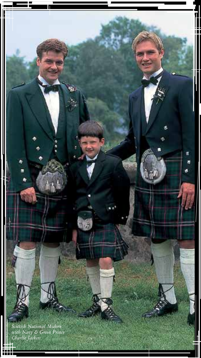
Scottish National Modern with Navy & Green Prince Charlie Jackets

All of Houston's Kilts are traditional 8 yard handmade kilts and Made in Scotland.