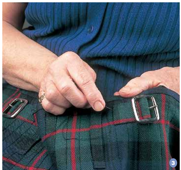
Super Hand Made Deluxe Finish