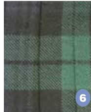
Super Machine Under Stitch

Finally all checked and hand finished and super pressed to keep the pleats nice and sharp, this is the kilt finish we use for all pipe bands and for the Royal Regiment of Scotland and all MOD, and these were the ones we made for the Scottish Army at the opening and closing ceremony of the Glasgow Commonwealth Games in 2014.