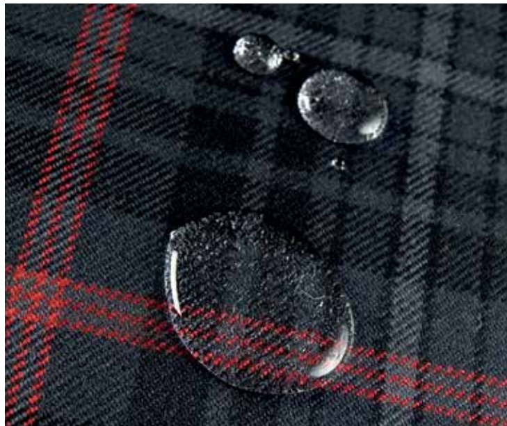
Teflon Coated - Stain Proofed - around 350 tartans available

We calculate over the life of your kilt you will save approx £180 to £260, not having to get your kilt dry cleaned as often. This also helps the environment. The Teflon coating lasts a minimum of 18 dry cleanings.