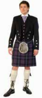
High Waistcoats Option + £99