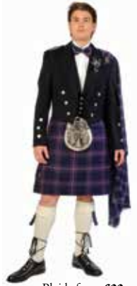
Plaids from £99