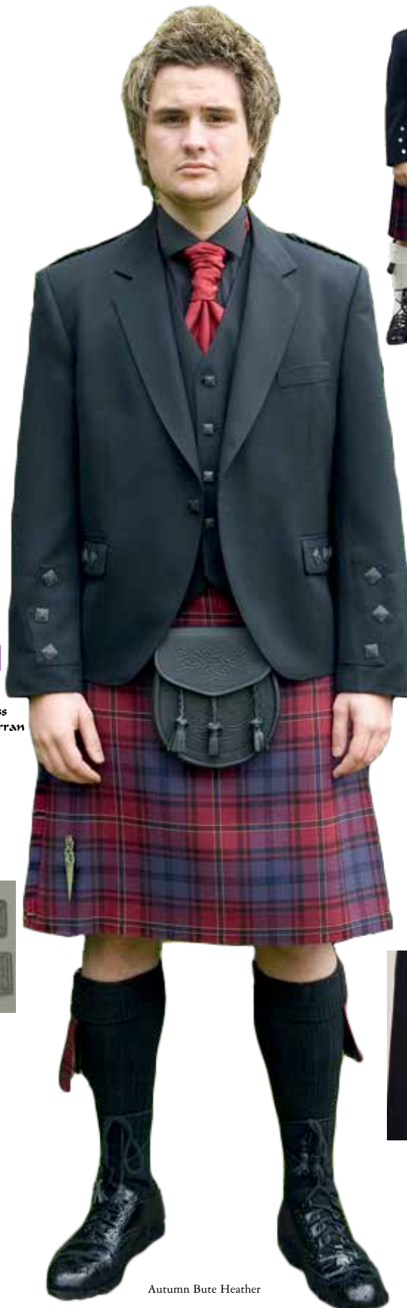
Autumn Bute Heather