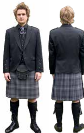
Grey Bute Heather