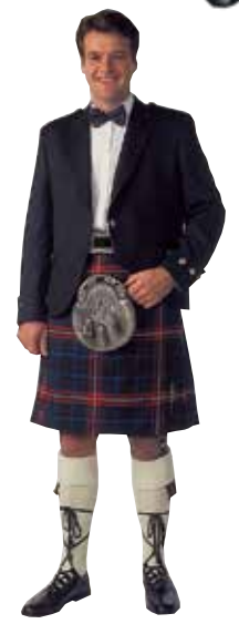
Argyll Dressed Up With Bow