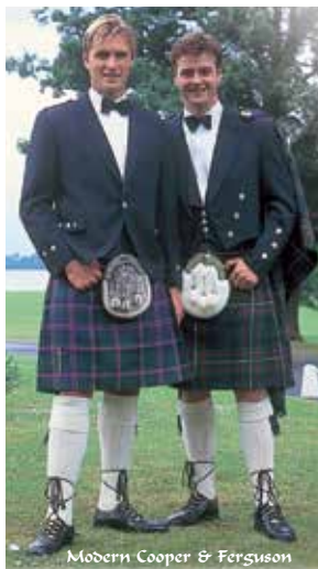
Modern Cooper & Ferguson