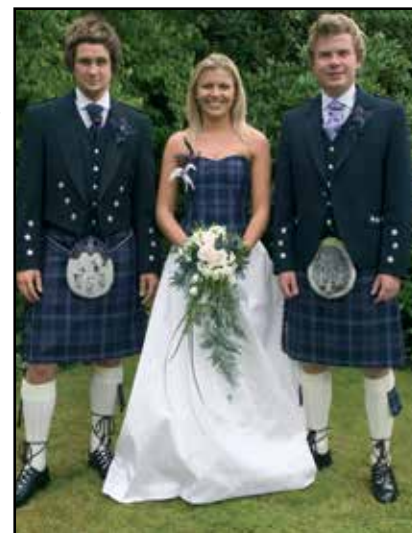
Bute Heather Modern