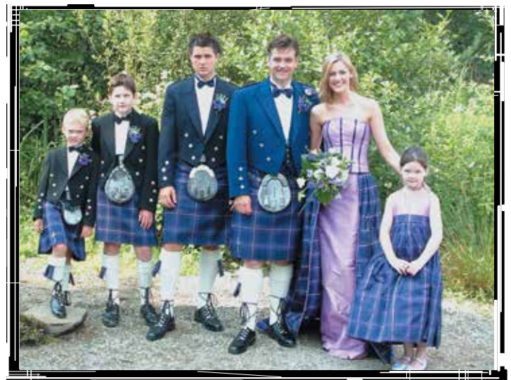
Spirit of Scotland