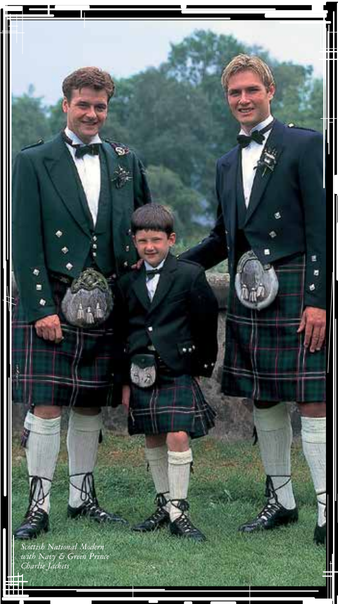
Scottish National Modern with Navy & Green Prince Charlie Jackets

Free Hire If you buy a kilt over £300 and are thinking of buying a full kilt pack, you can try a courtesy hire Prince Charlie full kilt pack value £60 absolutely FREE OF CHARGE specialists jackets, coloured jackets & antique / black button silverwear at £60 extra or if you are getting married we can give you a loan of one of our hire kilts like Bute Heather range so the main wedding party are all in the same tartan and you can change into your own tartan at night. We are finding a lot of grooms doing this. (If you are a mail order customer you pay postage. UK mainland £40 return; Highlands & Islands £60 or overseas postage both ways.) Prices on request. Note any kilt bought £199 to £299, we will give a discounted hire pack at the value £60, get it for special price of £30 only. Or once you have bought your kilt and are thinking of buying a kilt pack you can upgrade within two weeks any kilt to qualify for the discount pack price. Where else gives you the chance to see what you look like in your own tartan, before making a commitment to purchase a full outfit?