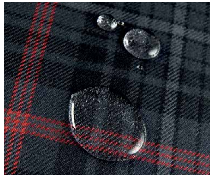
Teflon Coated - Stain Proofed - around 350 tartans available

We calculate over the life of your kilt wou will save approx \pounds 180 to \pounds 260 , not having to get your kilt dry cleaned as often. This also helps the environment. The Teflon coating lasts a minimum of 18 dry cleanings.