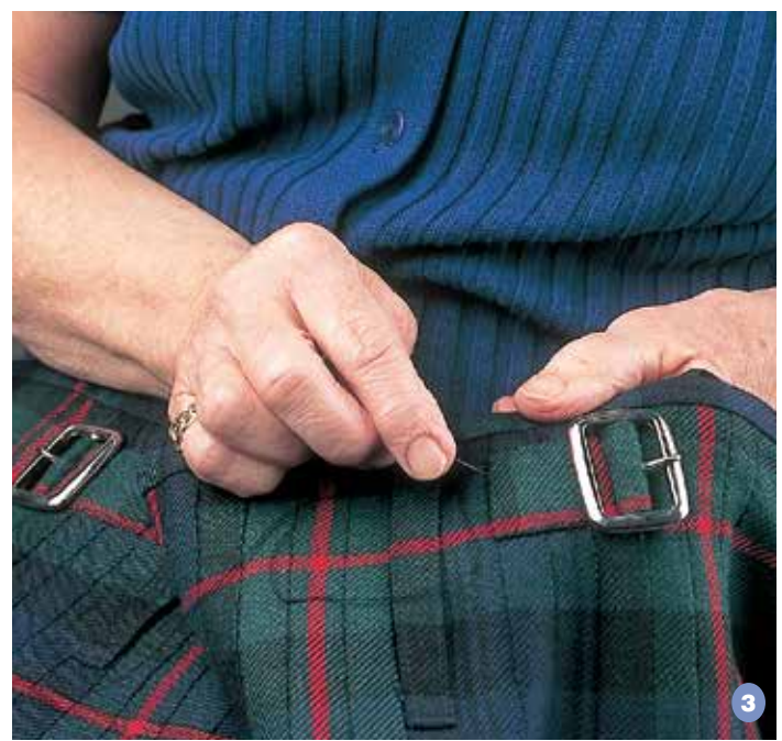
Super Hand Made Deluxe Finish