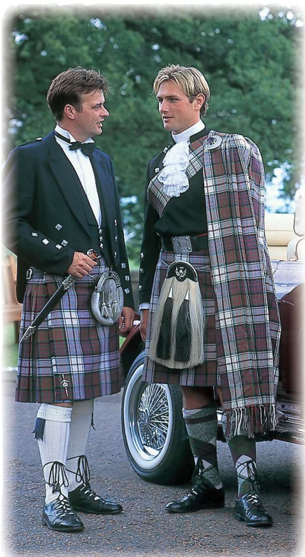
Matted dress MacDonald with Prince Charlie and Montrose Doublet with full plaid.

Boys kilt hose, white or black or grey £15 Gillie brogues (sizes 4 to 5 1/2) from £95 Boys blackwood sgian dubh £60 Boys shirts w/c black or white £35 Boys Jacobite shirts black/white £40 (Note: up to 32" chests and 26" waists are tax free.)