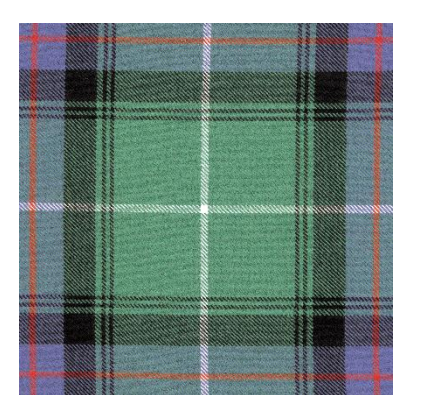
MacDonald of Clan Ranald Hunting

Hunting tartan tends to be woven in darker colours, more commonly in green for a camouflage effect.