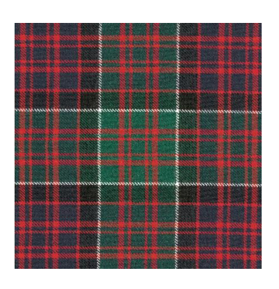
MacDonald of Clan Ranald Modern

Modern tartans are woven in rich, dark colours. The colours are always stronger and can be worn with navy blue or black jackets.