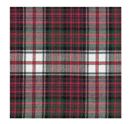
MacDonald of Clan Ranald Dress

Dress tartans are basically any of the above tartans woven with lots of white through the design. Dress tartans are generally worn by women.