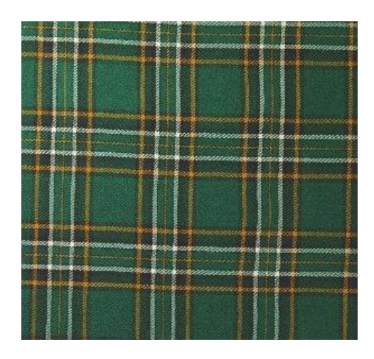
Irish national tartan

In Ireland, the word sept is used to refer to a group of people with both a common surname and common origin. In recent times, Irish septs are sometimes called clans, although Ireland does not have a clan system similar to that of Scotland. Related Irish septs belong to larger groups, sometimes called tribes, such as the Dál gCais, Uí Néill, Uí Fiachrach, and Uí Maine.