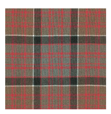
MacDonald of Clan Ranald Weathered or Muted

Weathered or muted tartans are woven in faded and muted colours. This gives the tartan an older appearance. In olden days, these tartans were coloured by natural pigment dyes.