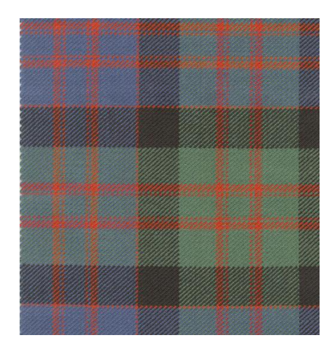
MacDonald Ancient Tartan