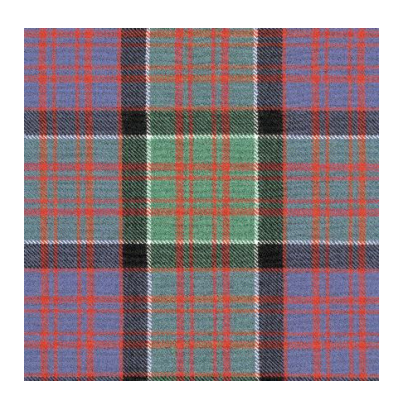
MacDonald of Clan Ranald Ancient

Ancient tartans are woven in soft, lighter colours. Ancient tartans can be worn with black or a range of tweed jackets.