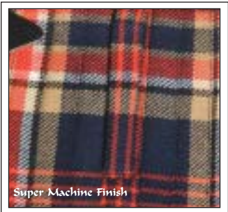
Super Machine Finish