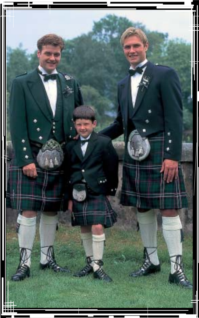
Scottish National Modern with Navy & Green Prince Charlie Jackets

Note any kilt bought £140 to £299, we will give a discounted hire pack at the value £55, get it for special price of £30 only. Or once you have bought your kilt and are thinking of buying a kilt pack you can upgrade within two weeks any kilt to qualify for the discount pack price. Where else gives you the chance to see what you look like in your own tartan, before making a commitment to purchase a full outfit?