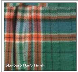
Standard Hand Finish