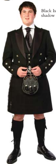
Black Isle shadow check