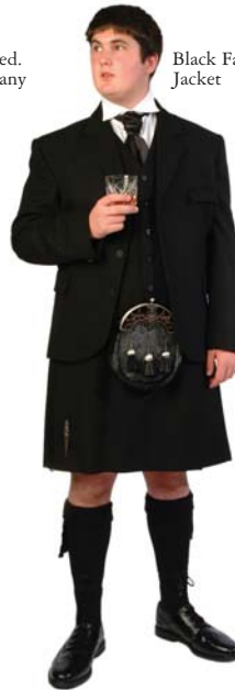
Black Fashion Jacket