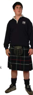
K Rugby Some imported 3 yard kilts suitable for Rugby/Football/Drinking/Supporters etc. A few tartans sizes 30" to 46" waist £60 Imported sporrans from £30