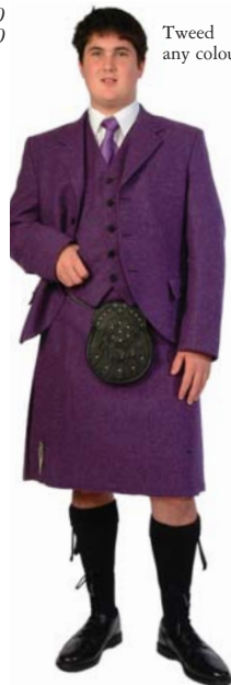
Tweed any colour