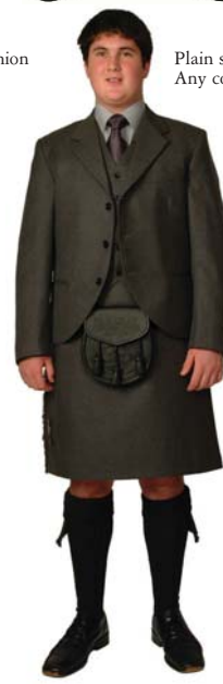
Plain soft fabrics. Any colour