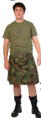
Combat kilt & sporran K87E