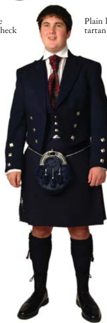
Plain kilts with tartan inlays