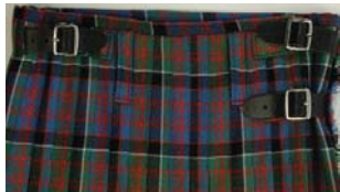
4 Yard Casual

45" waist/seam to 50" + 1 yard extra +15% 51" waist/seam to 55" + 2 yard extra +20% 56" waist/seam to 62" + 3 yard extra +30% Express Service Delivery 1-2 weeks Machine Super Finish +£40 1-2 weeks Hand Super Finish +£50