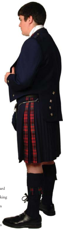
Plain kilts can be made with first & third pleat with tartan inlay in wool or silk.™ +£100 on 8 yard Super Hand Finish kilts only. Most popular colours Black, Grey, Navy, Black-Bute on any colour.