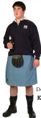
Denim kilt K87D