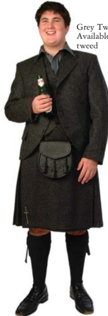
Grey Tweed. Available any tweed

New Century Plain Kilts in 13oz, 17oz, Barathea wools, Tweeds, Shadow checks in Black Isle and Navy Isle and our own Black Bute Teflon Coated. Fine suit fabrics. We can make anything you wish just ask us.