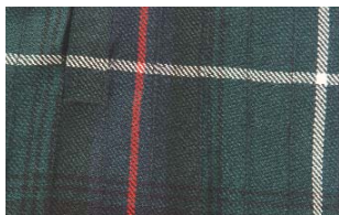
6 Yard Semi