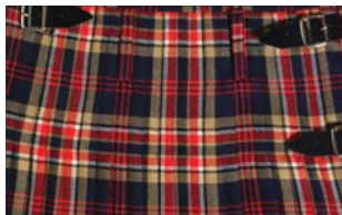
8 Yard Basic Finish