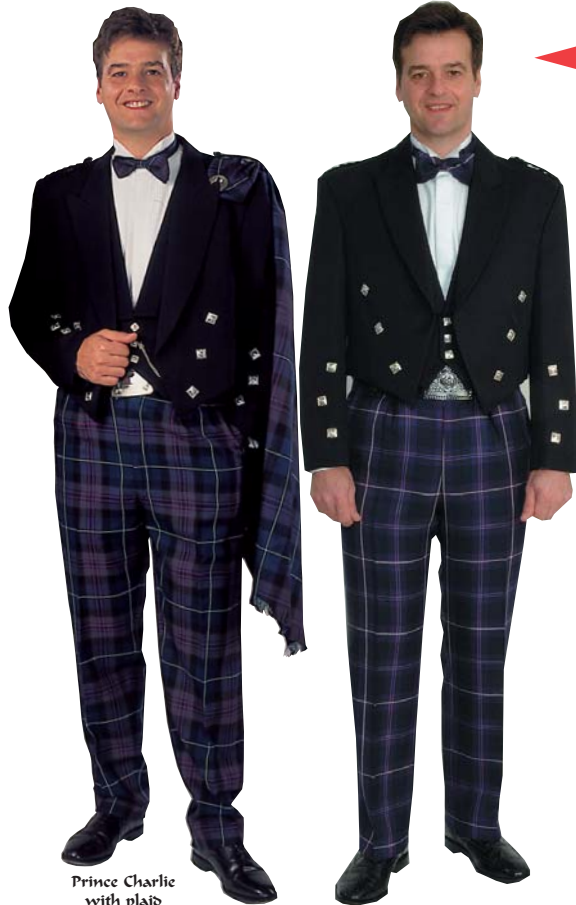
Prince Charlie with plaid

◀ Prince Charlie Jacket & waistcoat with tartan trews or trousers, can be worn with or without shoulder plaid.