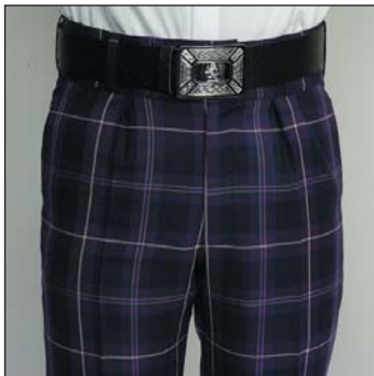
Argyll Trews with high waistband