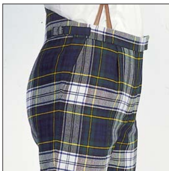
Fish Back Trews