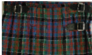
4 Yard Casual with shallow pleats

45" waist/seam to 50" + 1 yard extra +15% 51" waist/seam to 55" + 2 yard extra +20% 56" waist/seam to 62" + 3 yard extra +30% Express Service Delivery 1-2 weeks Machine Super Finish (+£50) 1-2 weeks Hand Super Finish