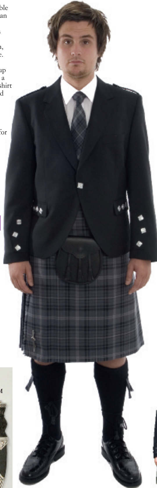
Grey Bute Heather

Best all round style for overseas ex-pats.