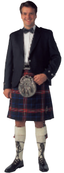
Argyll Dressed Up With Bow