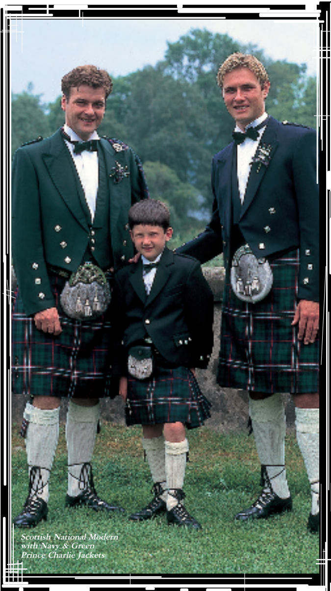
Scottish National Modern with Navy & Green Prince Charlie Jackets

All Houstons kilts are traditionally 8 yards hand made in Scotland.