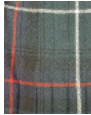
Super Machine Top Stitch