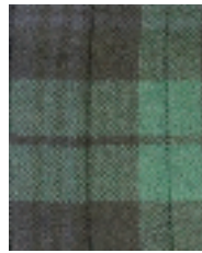
Super Machine Under Stitch