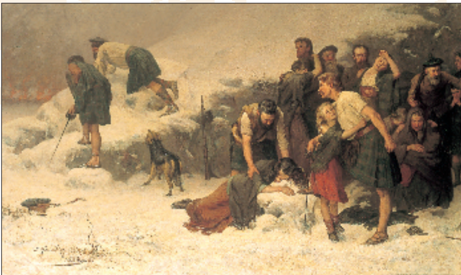
Massacre of Glencoe by Hamilton

At Houston Traditional Kiltmakers we get customers visiting our shop from all parts of Scotland, the U.K., Europe and the rest of the world. Our professional staff will advise on tartans you can wear from a choice of around 14,000 different tartans.