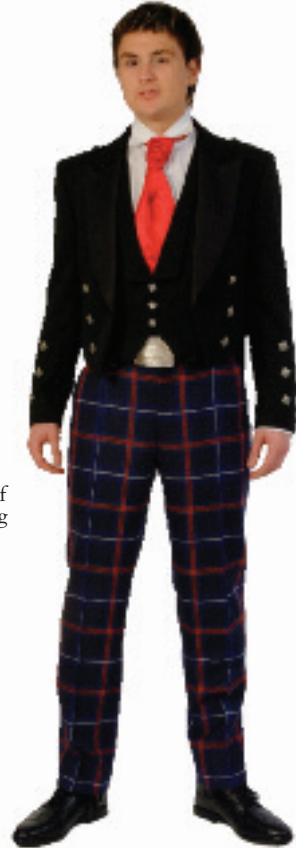
Silk or Wool Waistcoats