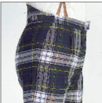
Fish Back Trews