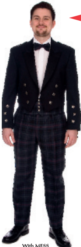
With MESS W68 Waistcoat

◀ Prince Charlie Jacket & waistcoat with tartan trews or trousers, can be worn with or without shoulder plaid. 13oz Old & Rare + 17oz strome + 30%