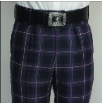
Argyll Trews with high waistband