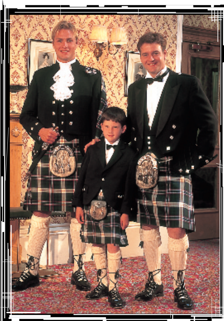
Scottish National Dress with Sherrifmuir & Regulation Doublet and boys Argyll